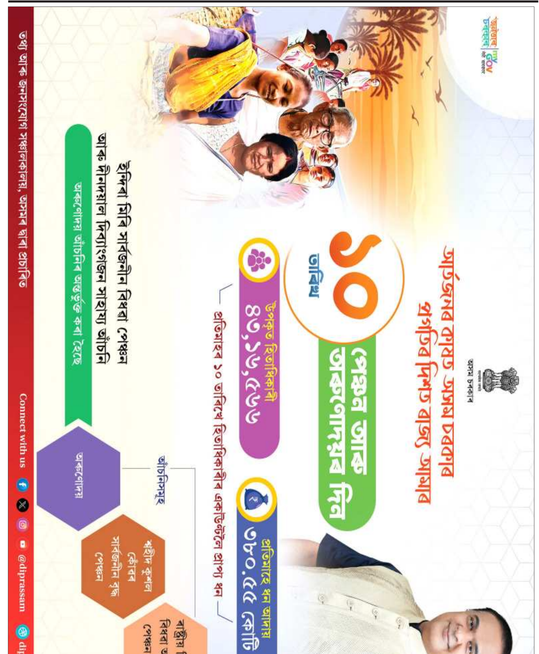
The Assam Jyoti : 21 FEBRUARY, 2025