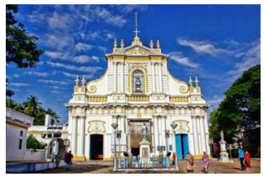
continue to page 8

of France to take urgent and necessary measures to give effect to the wishes of the people.[8] The government of India had made it clear that the cultural and other rights of the people would be fully respected. They were not asking for the immediate transfer of de jure sovereignty of France. Their suggestion was that a de facto transfer of the administration should take place immediately, while French sovereignty should continue until the constitutional issue had been settled. Both India and France would have to make necessary changes in their respective constitutions. All this would take time, while the demand of the people was for an immediate merger without a referendum. The government of India was convinced that the suggestion which they made would help to promote a settlement, which they greatly desired. On 18 October 1954, in a general election involving 178 people in municipal Pondicherry and the Commune of Panchayat, 170 people were in favour of the merger, and eight people voted against.