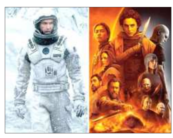
Awards. Both Dune: Part Two and Interstellar will share shows in IMAX screens across the country."

tain America: Brand New World. Both these films got a release in IMAX as well." The source continued, "Many were aware that Interstellar had just a one week run. Hence, it held very well in the weekdays, collecting Rs. 2 crore plus. Yet, there was a section of moviegoers who missed out the film and they expressed their views online that a one week run for a such a high-demand film was not done. Keeping this feedback in mind, Warner Bros has decided to bring back the film in IMAX." The source further said, "Warner Bros has also decided to get rereleased Dune: Part Two. It also has a following and moreover, it is back in the news after winning the Best Sound and Best Visual Effects awards at the 97th Academy