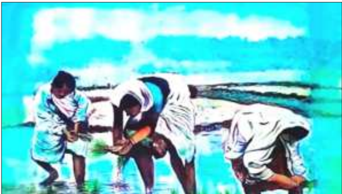
Painting 1: Women at Work in the Paddy Fields, 30 x 36 inch. Oil on Canvas, 2019 Image Curtsey: Author's Own Creation

gave us new perspectives on and ways to engage with the world. Whether realistic or abstract, a painting's visual impact can arouse a variety of feelings and ideas, from calm to reflection or even agitation. Additionally, painting on canvas enables the manipulation of time and space. What a viewer sees is not just an image; it is a world that the artist has constructed,