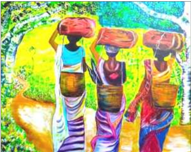
Painting 2: The Women of the Village, 30 x 36 inch. Oil on Canvas, 2019 Image Curtsey: Author's Own Creation

01. Introduction: For ages, painting has been used as an artistic medium to capture the essence of society, culture, emotion, and philosophy, providing a window into the human condition. Painting has changed over time, from the earliest ancient cave paintings to modern