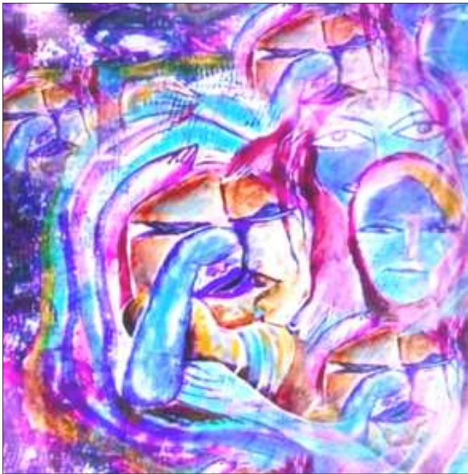
Painting 3: Illegitimate Birth, 30 x 36 inch. Acrylic on Paper, 2019

paint to represent colonial histories, indigenous struggles, and international wars, giving voice to under-represented groups and challenging dominant narratives. Additionally, painting is frequently used as a cultural preservation strategy. In addition to narrating historical events, Chinese ink wash paintings, indigenous Australian dot art, and Egyptian tomb paintings all contribute to the establishment and maintenance of cultural identity. Artists continue to experiment with cultural hybridisation in today's globalised environment, fusing old methods with contemporary concepts to produce fresh