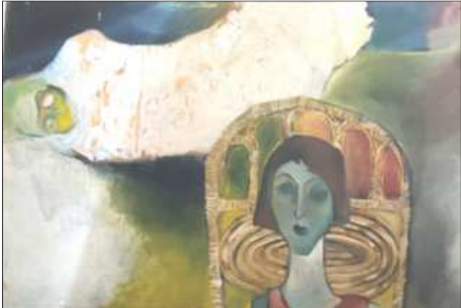
Dream Girl -Oil on canvas 2.3"x3.2.", 1988

“Lottery Ticket Seller” by Pen & Ink demonstrates his deep interest in daily life. One of his best-known compositions, it encapsulates the essence of local culture and peculiarities. The identity of a lottery ticket dealer is depicted in the art. It demonstrates that everyone has a difficult existence. This painting depicts a man who sells lottery tickets in the marketplace to make ends meet despite leading a difficult life. In addition, it has been seen that the individual see page 10