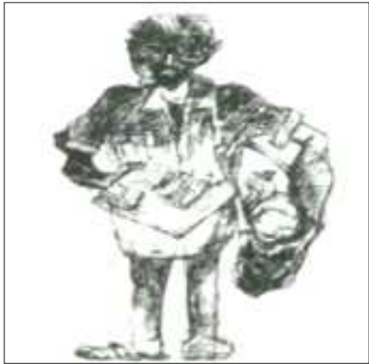
Lottery Ticket Seller –Pen and Ink, 1980