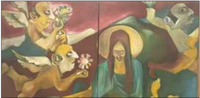
Plate: 2- The Death - Oil on Canvas, 48"x36", 1980, Image Courtesy: Gallery Benu Misra

In understanding the contemporary art of Assam, the works of Benu Misra thus stand as brilliant milestones. They reflect artistic courage, intellectual depth, and emotional honesty. His creations deserve greater preservation, documentation, and recognition see page 10