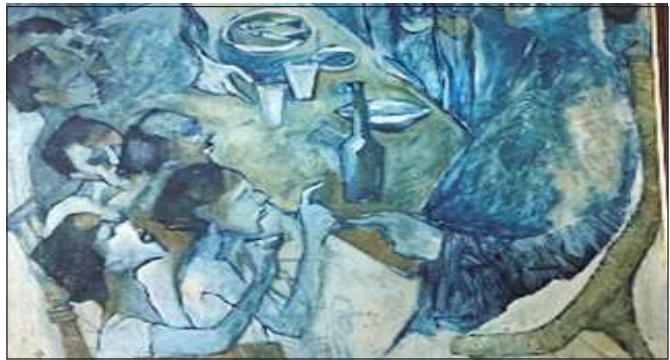
Plate: 1- Last Supper -Oil on Canvas, 3.1"x3.1", 1986, Image Courtesy: Gallery Benu Misra

shift that mirrors the broader movement of Indian contemporary art. In a period when Assamese art was navigating new directions, Misra offered both leadership and inspiration, shaping the